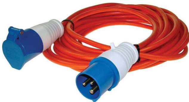
Typical 25 metre long hook-up cable with round plug and socket

Campers must bring their own 25 metre long hook-up cable with round plugs. Suitable hook-up leads can be obtained from most caravan equipment suppliers. It's the standard outlet found on many campsites. Plugs and sockets must be round IP44 splash-proof three-pin industrial connectors to BS EN 60309-2. Cable must be double-insulated, three-core flexible outdoor cable, at least 1.5mm 2 cores, 2.5mm 2 cores are required to draw 6A. A shorter cable (10m or 15m long) might not reach and could constrain how you arrange your pitch.